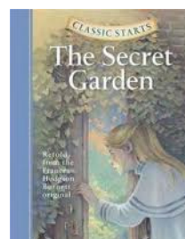
January 8th The Secret Garden (retold from original) By Francis Burnett

This year we have chosen to change book club up a bit in hopes of reaching new participants and readers. After considering the input of participants and staff, we have decided to begin "A Year of Classics." Each month we will read and discuss a selected title of popular classic literature, if you have a personal favorite please let us know. Come join us the first Wednesday of every month at noon and be sure to bring a sack lunch. WCPL will provide drinks and dessert.